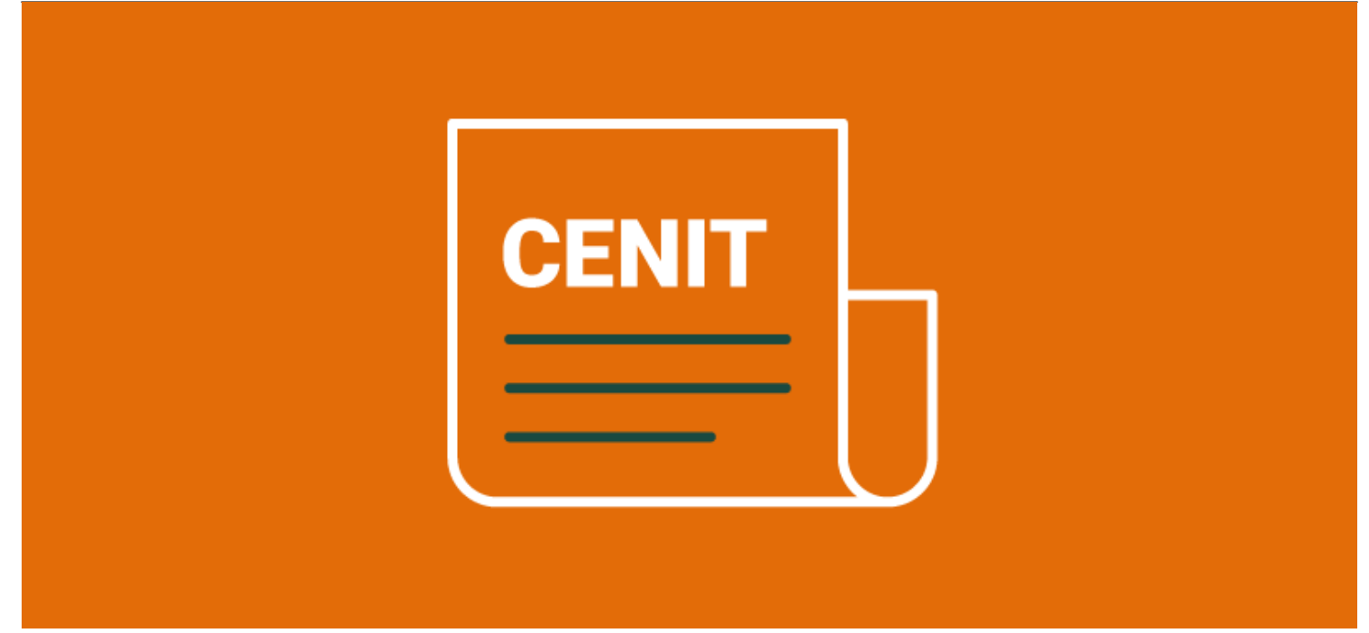
The Compensación Electrónica Nacional Interbancaria (CENIT in Spanish, national interbank electronic settlement system, managed by Banco de la República).