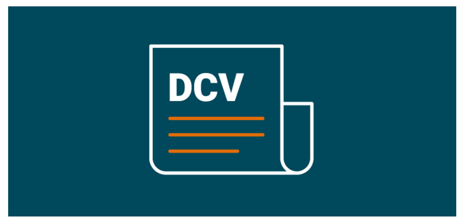
The Depósito Central de Valores (DCV in Spanish, Central Securities Depository managed by Banco de la República ).