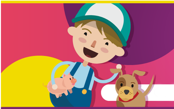
Global Money Week (GMW)

Virtual training / On-site training for blind people / Virtual self-training / Open on-site training / On-demand on-site training