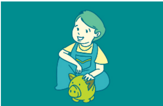
From the School to the Central Bank – Essay Contest