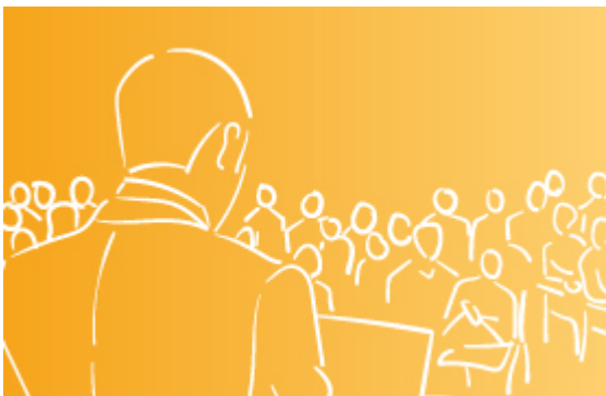
Advanced Course in Economics for Professors (CAEP in Spanish)